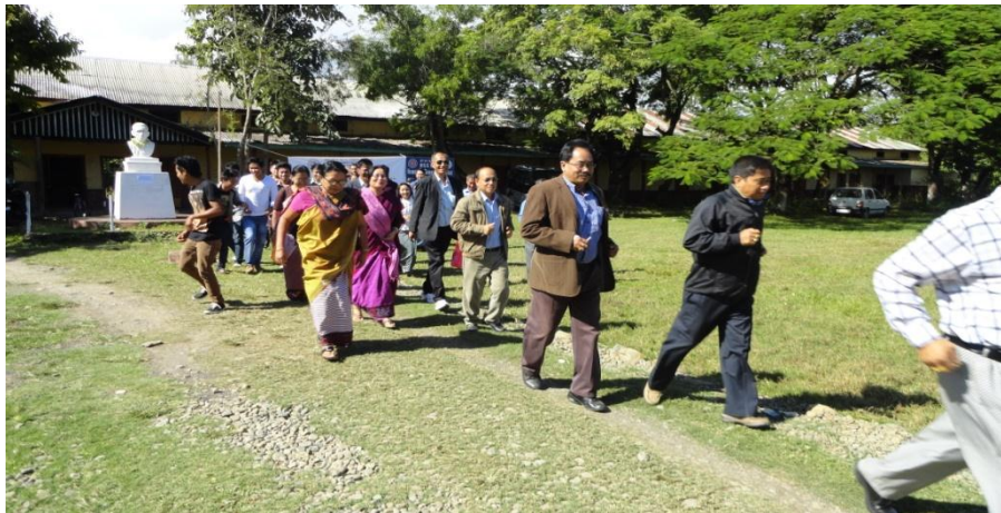
Photo No.5: Run for Unity around the Campus by the Senior & Junior Staffs.