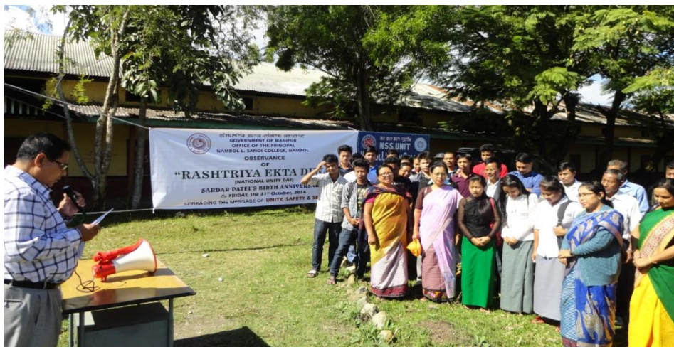
Photo No.9 : The Principal, Staffs and Students took this vary day, the 31 st October as the TOP PRIORITY and TIME BOUND for keeping National Unity, Safety and Security on the Sardar Patel Birth Anniversary Day.

Lastly, not the least that the College, its staffs and students pray the Godfather to make blessing our nation in better way.